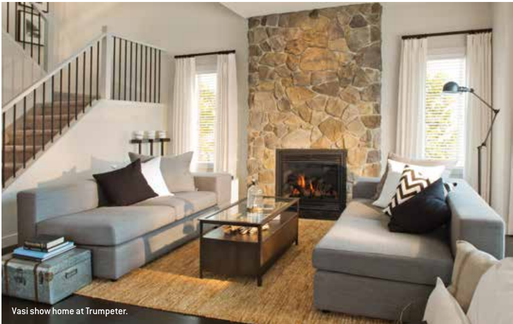
Vasi show home at Trumpeter.