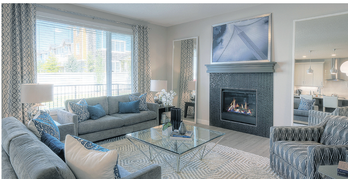
The great room in the Kirkwood is a welcoming place for the family to gather.

At certain ages, having all of the sleep spaces on the same level is