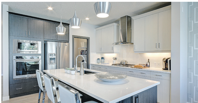
The kitchen wraps around a spacious central island with a sink and extended eating bar that seats three. Appliances are stainless steel.

key. This home has four bedrooms on the second floor, led by a 14 foot six inch by 13 foot nine inch master bedroom along the back.