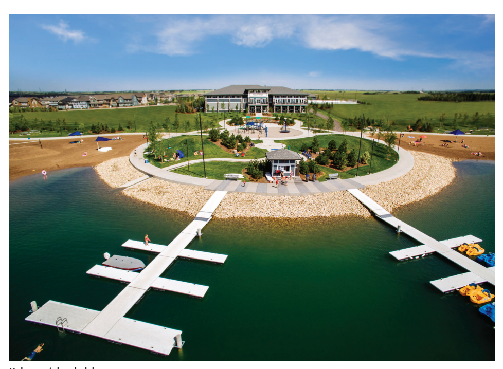
Mahogany's beach club.

"Envisioned as a complete community where urban living is redefined to match the