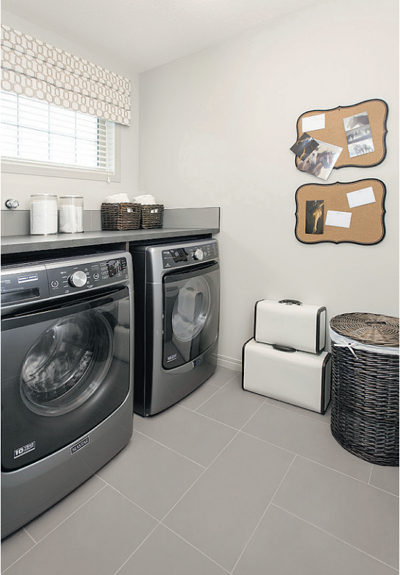
The spacious laundry room in the Envoy features front-load washer and dryer.

ALSO BUILDING IN EVANSRIDGE, LEGACY, MAHOGANY, NEW BRIGHTON, NOLAN HILL AND SYMONS GATE.