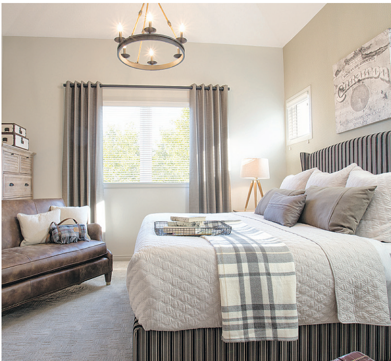
The convenient main floor master bedroom boasts a spacious walk-in closet with wire shelving and a luxurious ensuite.