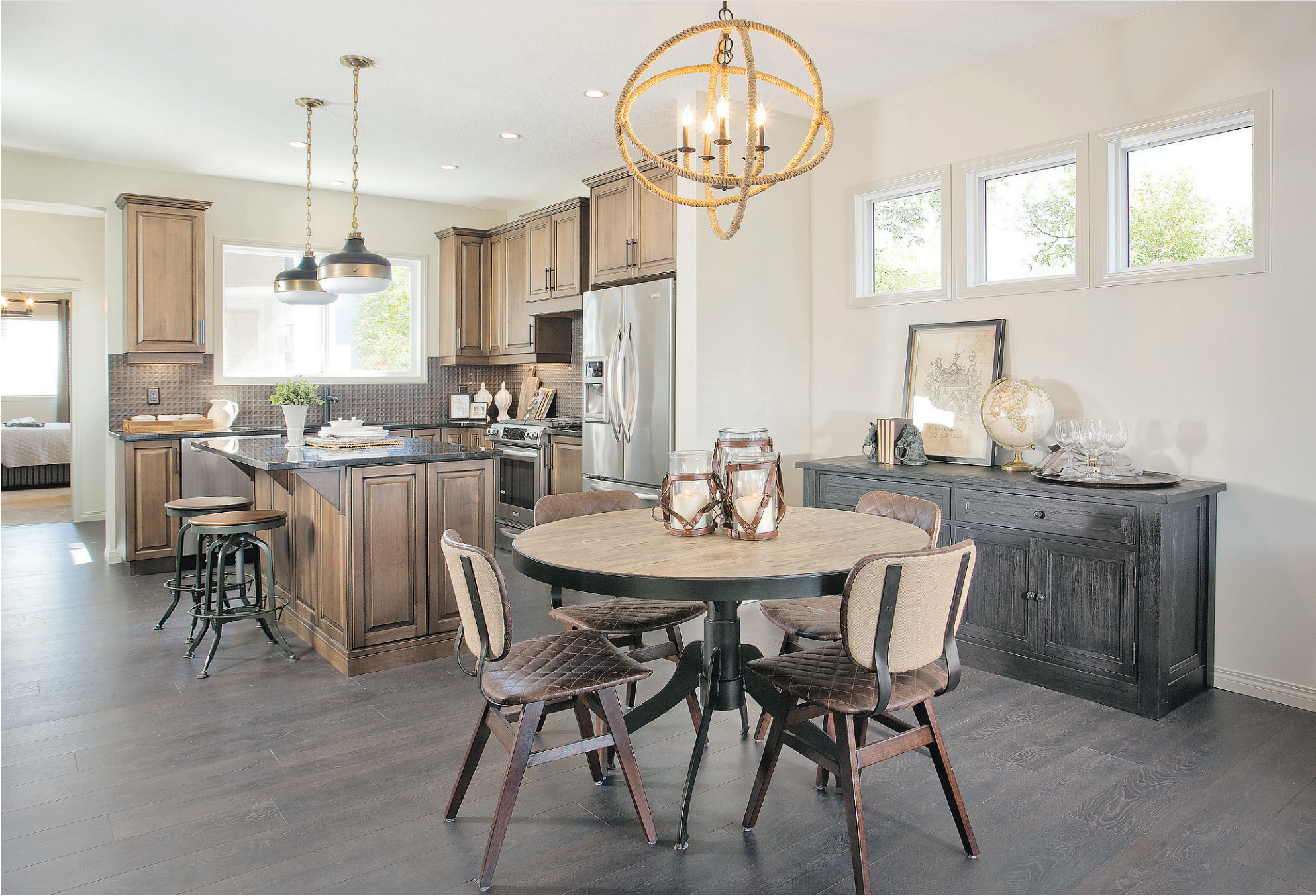
An eye-catching L-shaped kitchen offers plenty of walking-around room and wraps along two sides of an island and extended eating bar with stools to seat two. An open-concept design connects the kitchen to a dining area