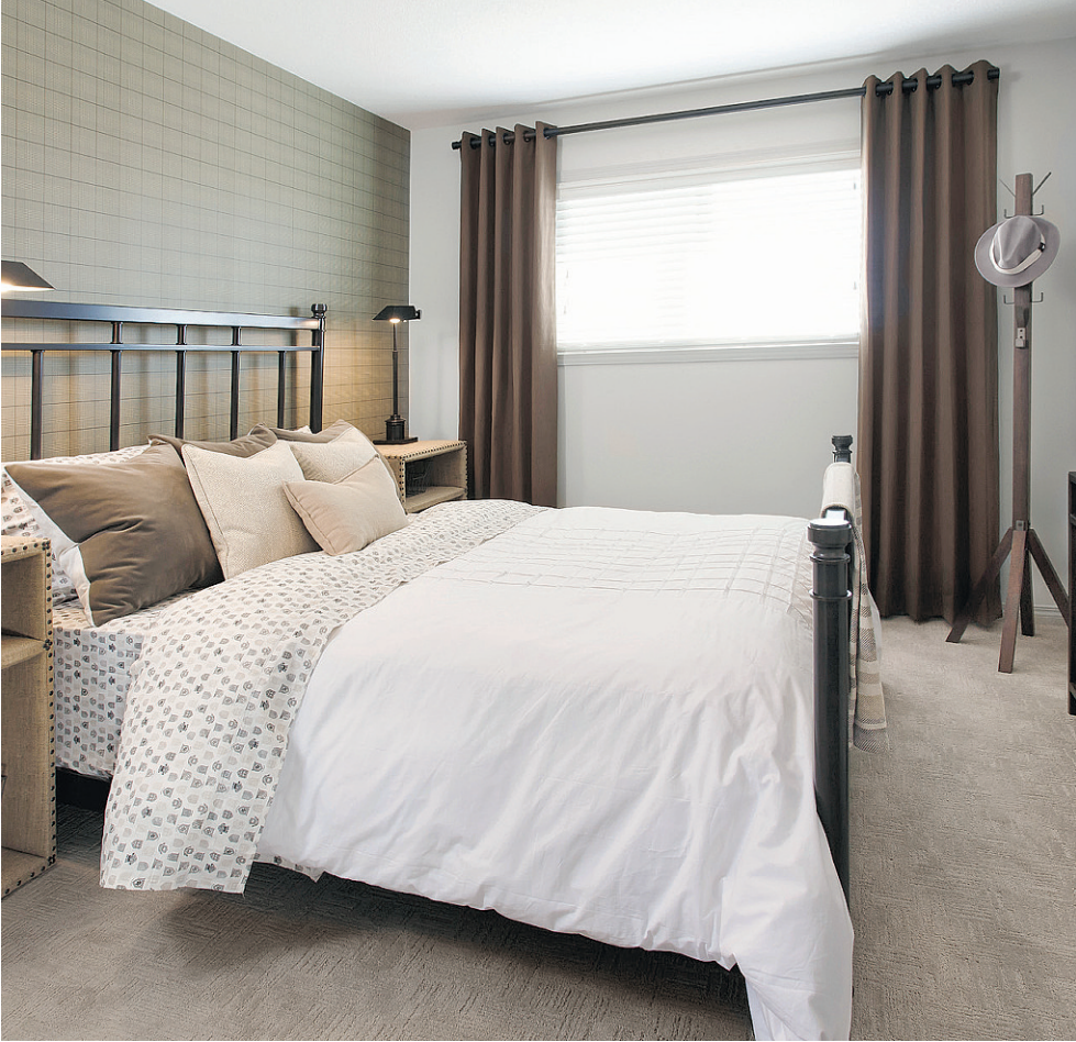
The two secondary bedrooms are on opposite ends of the second floor, separated by a full bathroom and 13-foot by 14-foot bonus room.

Model: The Envoy is a laned home. Builder/Developer: Hopewell Residential. Area: Mahogany is a community in southeast Calgary. Hours: The show home is open 2 to 8 p.m. Monday through Thursday, and noon to 5 p.m. on weekends. Directions: The show home is located at 17 Masters Cr. S.E. To get there, take 52nd Street to Mahogany Gate, head left on Mahogany Boulevard and left on Masters Crescent. Information: hopewellresidential.com