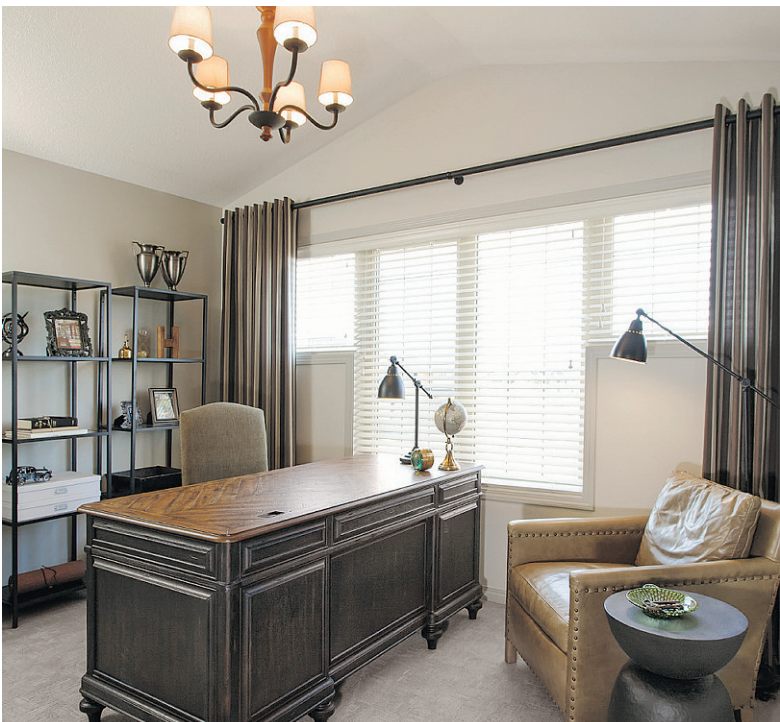
One of two secondary bedrooms has been converted into a home office in the Envoy show home to highlight the versatility of the space.