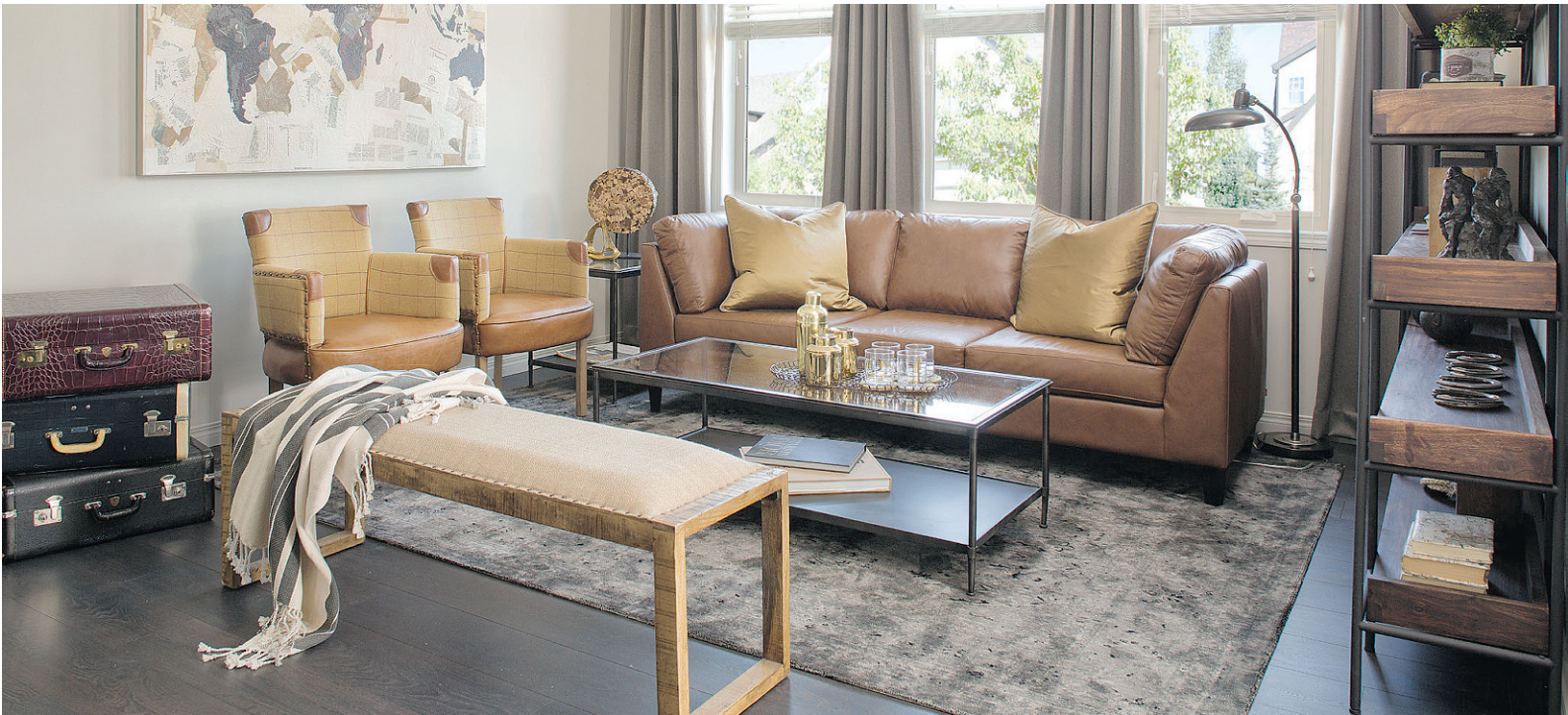
The second floor bonus room in the Envoy in Mahogany is an impressive 13-foot by 14-foot space.