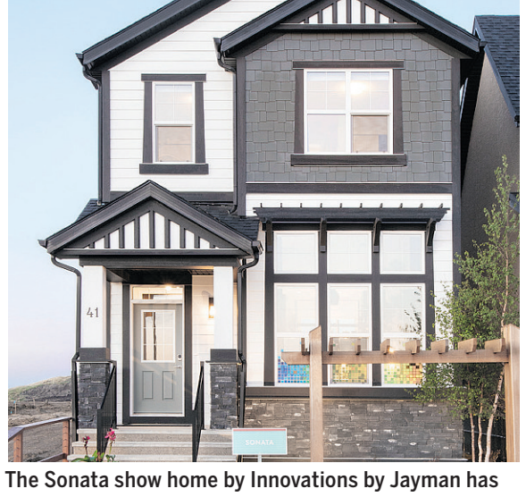
"a very modern plan." INNOVATIONS BY JAYMAN

"It's raised two steps above the lifestyle room, on the way upstairs to the second floor. It's tucked to the side of the home, and is a quiet, yet still central, space to do homework or have your home office,"